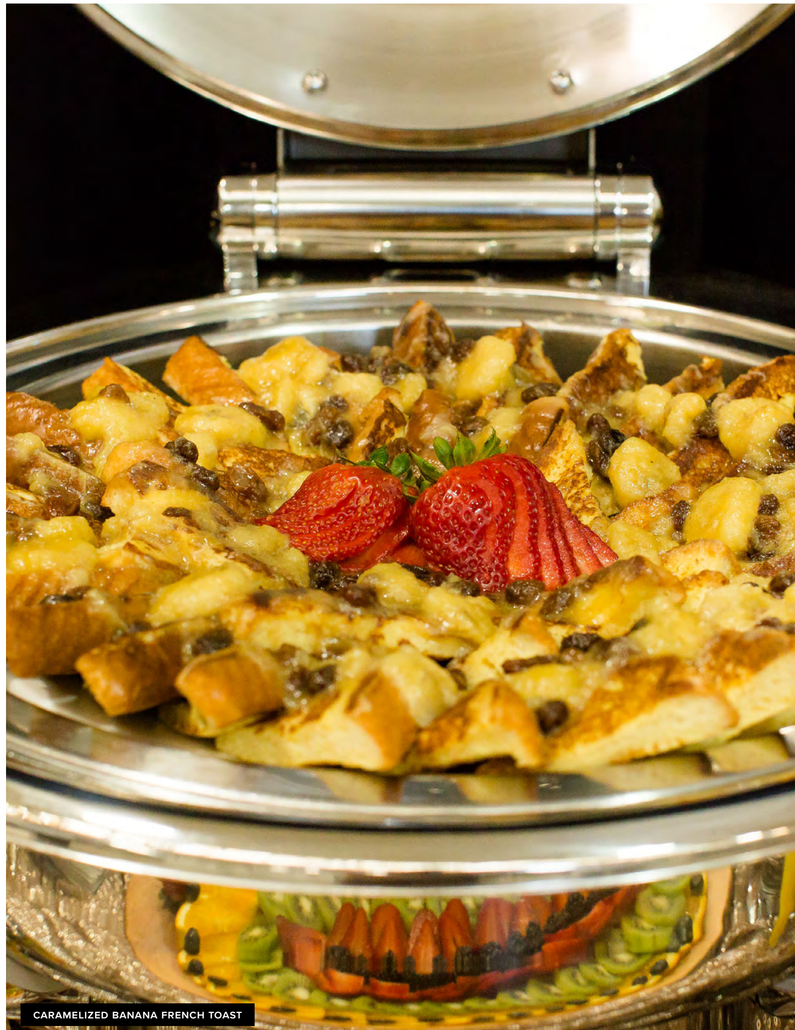
CARAMELIZED BANANA FRENCH TOAST