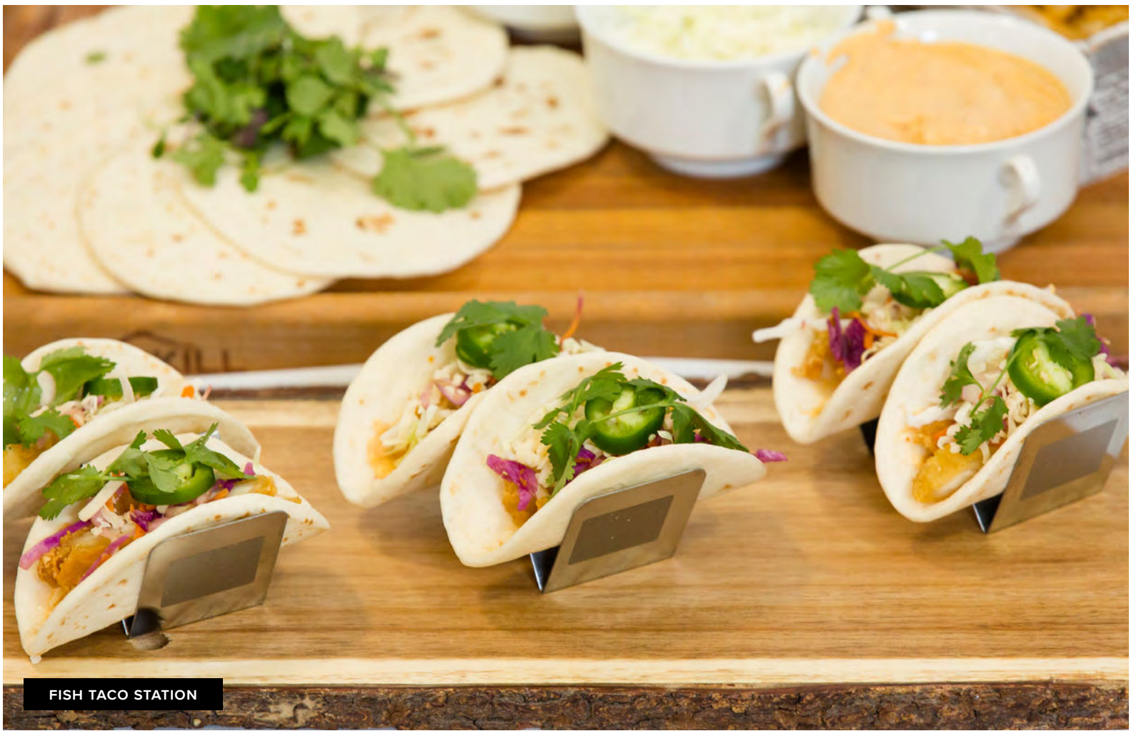
FISH TACO STATION