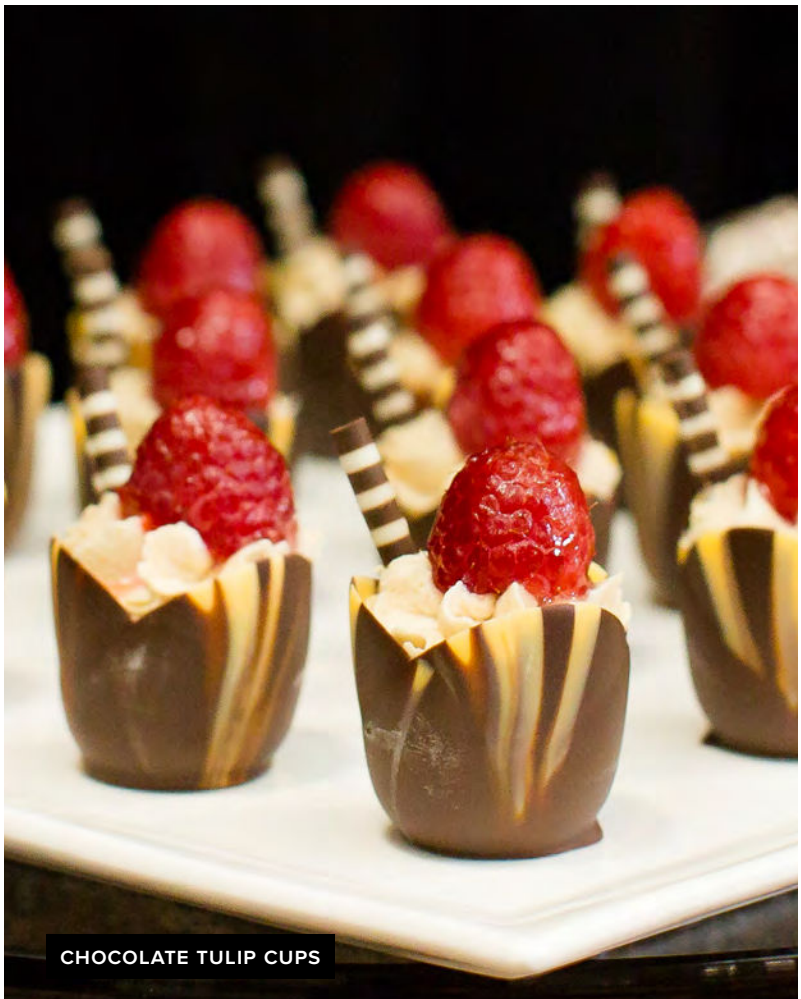
CHOCOLATE TULIP CUPS