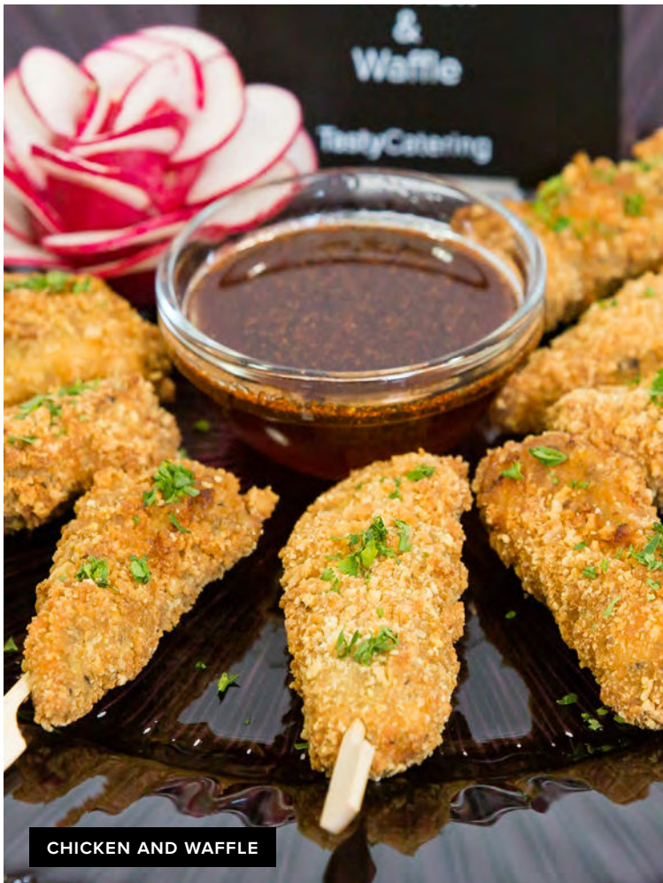
CHICKEN AND WAFFLE