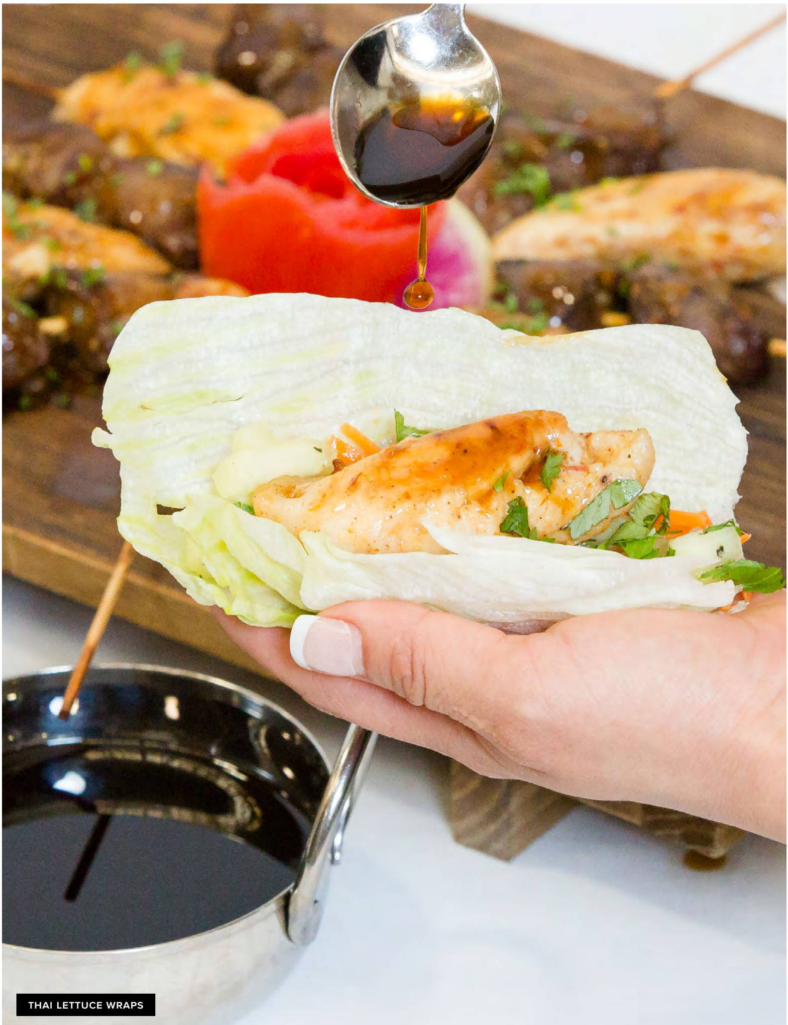
THAI LETTUCE WRAPS