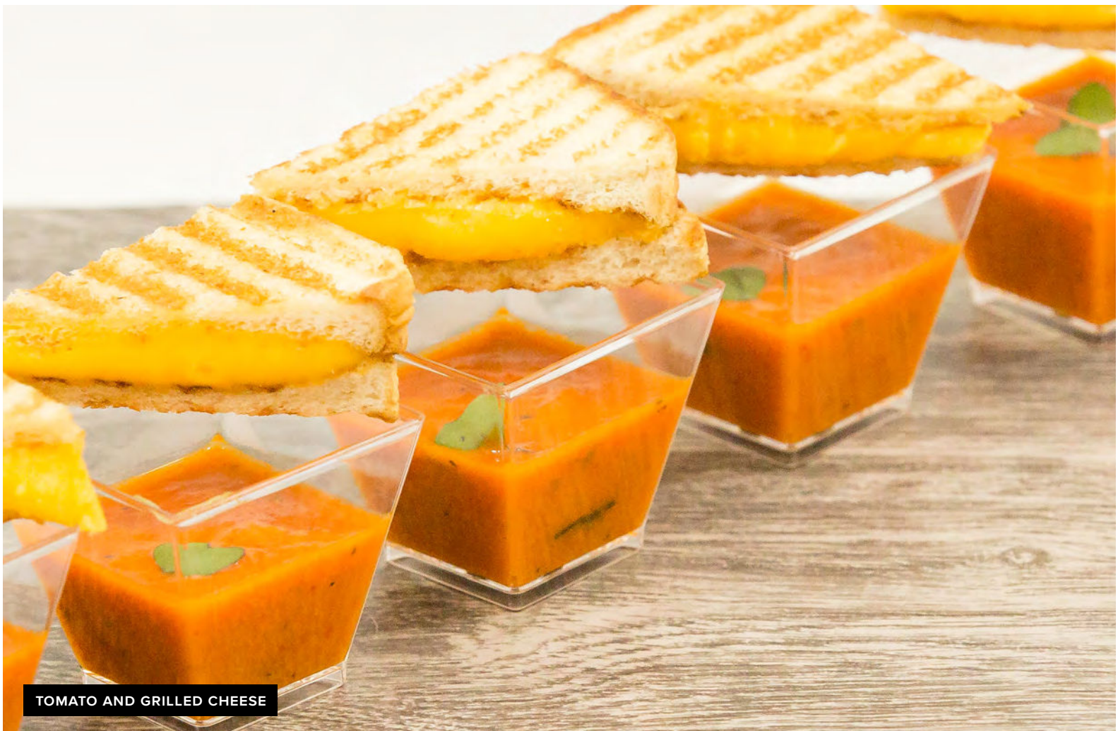
TOMATO AND GRILLED CHEESE