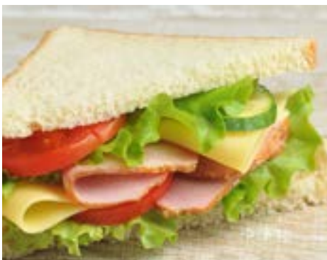
↑ MAKE-YOUR-OWN SANDWICH BUFFET

CAPRESE (V) CHICKEN PANINO ROASTED VEGETABLE HUMMUS (DF/VV) ADDITIONAL $.60 PER GUEST ROAST BEEF ADDITIONAL $.60 PER GUEST TURKEY AND BRIE