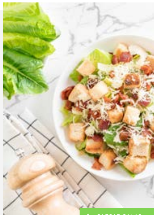
↑ CAESAR SALAD