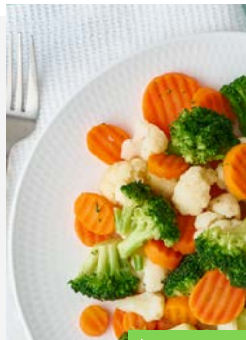
↑ VEGETABLE MEDLEY