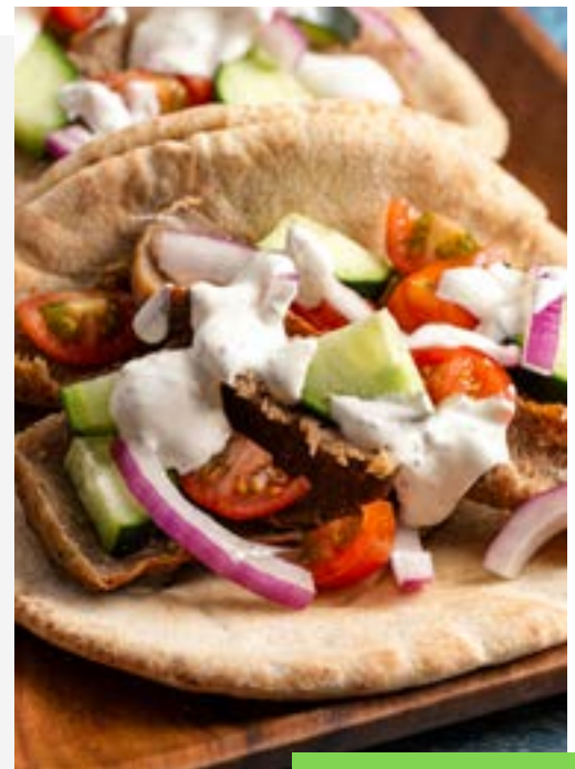
↑ GREEK FEAST

Sliced gyro meat (GF), marinated chicken (GF), grilled oregano vegetables (GF), vesuvio potatoes, Greek country salad, warm pita bread and tzatziki sauce