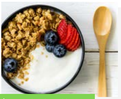
↑ MAKE-YOUR-OWN YOGURT BAR

Bakery fresh mini muffins, bagels, mini danishes, individual berry yogurt parfaits, condiments, bottled juices and water