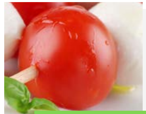
↑ PETITE CAPRESE SKEWERS

Fresh cucumber filled with buttermilk ranch and goat cheese spread topped with bleu cheese and tomato