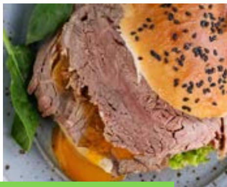
↑ ROAST BEEF SANDWICH

Brownie, dessert bar, fresh baked cookie