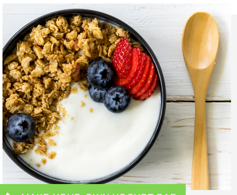
↑ MAKE-YOUR-OWN YOGURT BAR

Bakery fresh mini muffins, bagels, mini danishes, individual berry yogurt parfaits, condiments, bottled juices and water