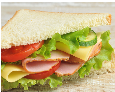
↑ MAKE-YOUR-OWN SANDWICH BUFFET

CAPRESE (V) CHICKEN PANINO ROASTED VEGETABLE HUMMUS (DF/VV) ADDITIONAL $.60 PER GUEST ROAST BEEF ADDITIONAL $.60 PER GUEST TURKEY AND BRIE