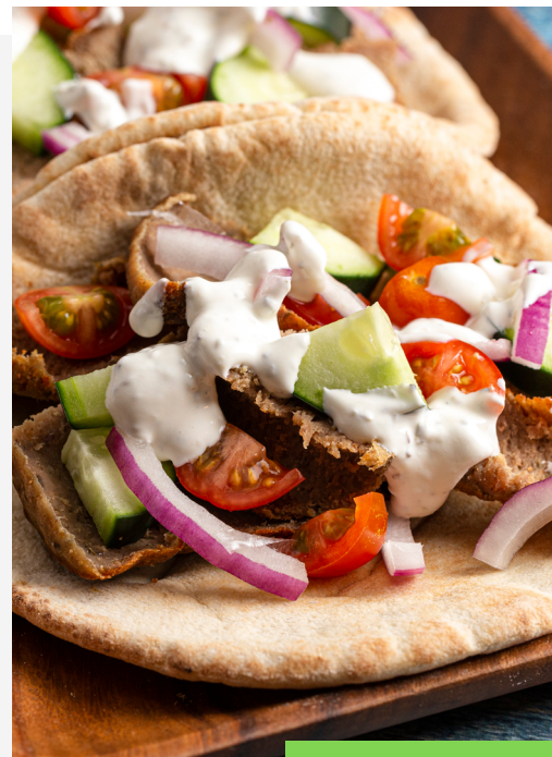
↑ GREEK FEAST

Sliced gyro meat (GF), marinated chicken (GF), grilled oregano vegetables (GF), vesuvio potatoes, Greek country salad, warm pita bread and tzatziki sauce