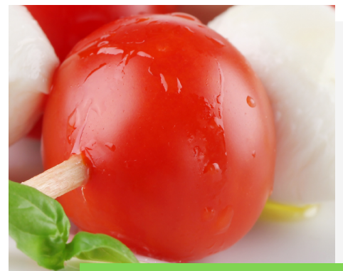
↑ PETITE CAPRESE SKEWERS

Fresh cucumber filled with buttermilk ranch and goat cheese spread topped with bleu cheese and tomato