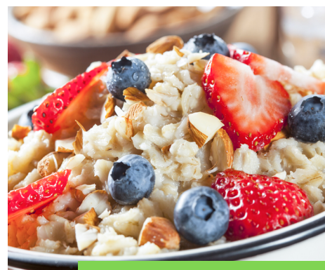
↑ MAKE-YOUR-OWN OATMEAL BAR

CHILLED HARD BOILED EGG (GF/V) $1.45 6 MINIMUM