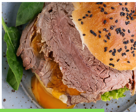
↑ ROAST BEEF SANDWICH

Brownie, dessert bar, fresh baked cookie