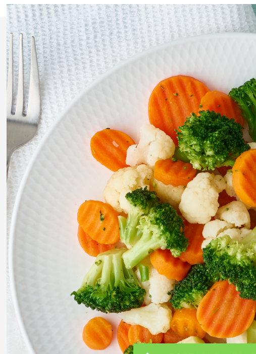
↑ VEGETABLE MEDLEY