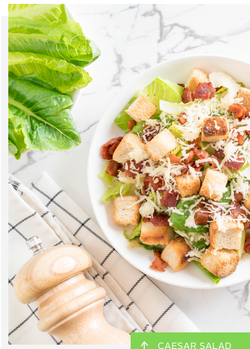
↑ CAESAR SALAD